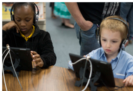
Clockwise from top left: STEM activities at Carroll County, Caroline County, Frederick County, Cecil County, and Wicomico County.