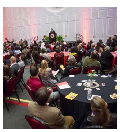
From Top: Cecil County Public Library, University of Maryland at College Park's iSchool